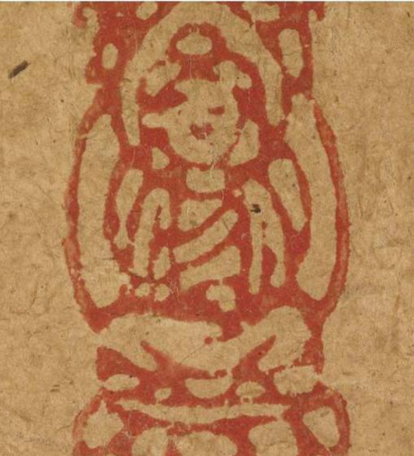
Dunhuang manuscript, Princeton University East Asian Library Dunhuang collection, PEALD 8g. Sūtra of Buddha Names (Foshuo foming jing 佛說佛名經)